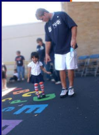
Greg Olsen helped a student hop through the alphabet.