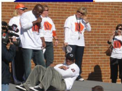
Brendon Ayanbadejo participated in a What Moves U event.