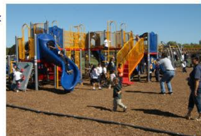
Students at Whittier will enjoy a brand new playground as part of the Fitness and Learning Zone.

NFL-wide day of service that provides NFL players from all 32 teams the opportunity to take part in a variety of community service activities, such as building homes for low-income families, visiting local military bases, or painting classrooms. Started in 1999 by the NFL and United Way, the "Hometown Huddle" continues to help make a difference in communities across the country.