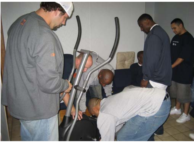
Members of the Bears 2006 Rookie Class worked to assemble fitness equipment during the Bears/United Way Hometown Huddle.

building homes for low-income families, visiting local military bases, or painting classrooms. The event was also the third of four volunteer activities the entire Bears rookie class will participate in as part of the "Rookie Rally" program, which was created by the Bears Community Relations department to involve the team's first-year players, as a group, in charitable activities throughout the season.