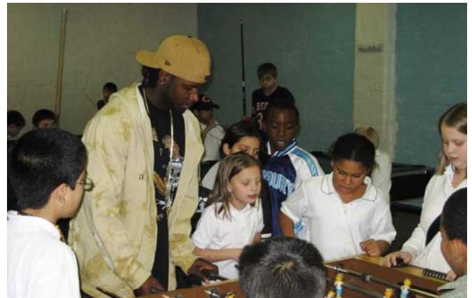
Devin Hester played a game of fooseball with members of the Valentine Boys & Girls Club.