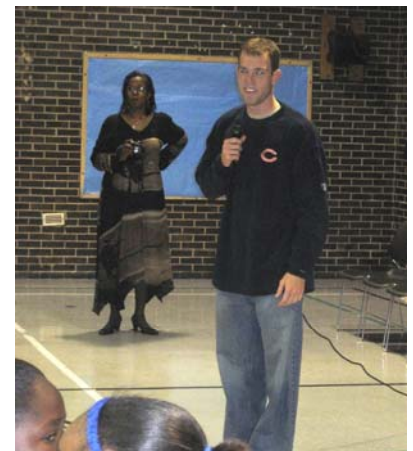
Robbie Gould spoke to students at Mollison Elementary School.

Each Tuesday during the football season, Chicago Bears players visit Chicago Public Schools to speak to, motivate, and interact with students as part of the Bears School Outreach program. The theme for player visits is character development, goal setting and commitment to excellence. Now in its 11 th season, the Bears School Outreach program reaches more than 7,000 students annually. To date, Bears players Bernard Berrian, Desmond Clark, Justin Gage, Robbie Gould, Tommie Harris, Todd Johnson, Terrence Metcalf, Fred Miller, Muhsin Muhammad, J.D. Runnels and Cameron Worrell have visited 10 different Chicago Public Schools in support of the Bears School Outreach program.