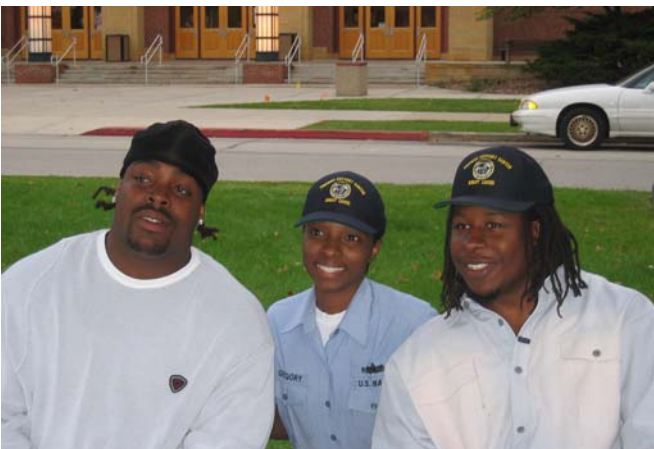
Tank Johnson and Adrian Peterson posed for a photo with one of the Navy's newest sailors during a visit to the Great Lakes Naval Station.