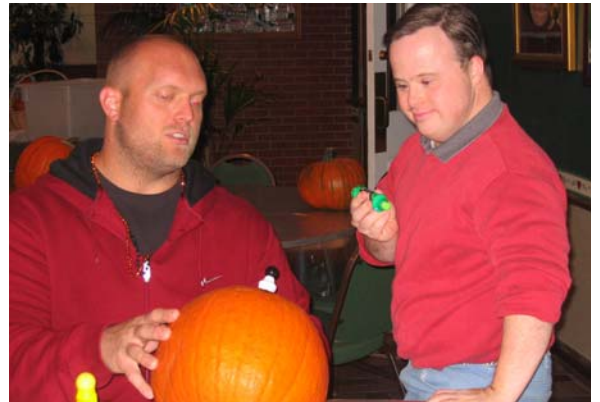
John Tait helps a resident at Misericordia decorate a pumpkin at their Halloween Party.

Bears offensive tackle John Tait and running back Adrian Peterson visited Misericordia Heart of Mercy in Chicago on Tuesday, October 25 for an early Halloween party. John and Adrian decorated pumpkins with approximately 50 residents from the facility before heading outside to play some football. This is the second year in a row Bears players have participated in Halloween festivities at Misericordia.