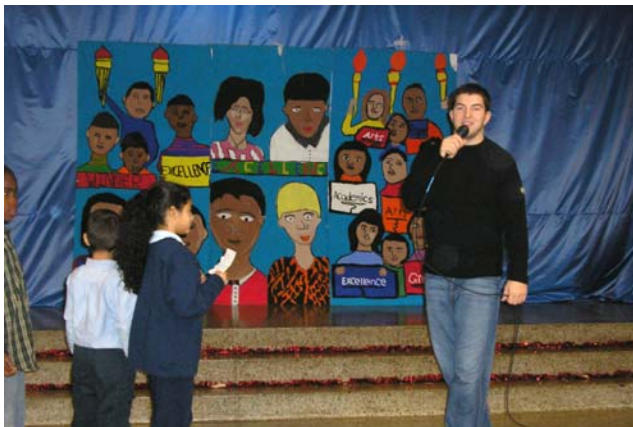
Rex Grossman speaks to students at North River School in Chicago.