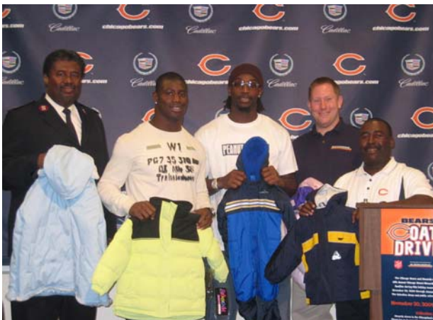
Jerry Azumah and Charles Tillman were the official spokesmen for the 2004 Bears Coat Drive.

Volunteers from Wm. Meyers Movers will be stationed at entrance gates to collect coats from generous fans. Coats can also be dropped off at all Dominick's stores from November 20, 2005 - January 17, 2006. To find a Dominick's store near you, please log on to www.Dominicks.com/StoreLocator.asp or visit www.ChicagoBears.com/community .