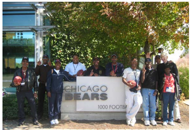
A group of adults who were evacuated from their homes in Louisiana because of Hurricane Katrina were guests of the Bears at a team practice on Friday, October 14. The group is currently staying at a temporary shelter in Tinley Park with over 100 other Hurricane Katrina evacuees.