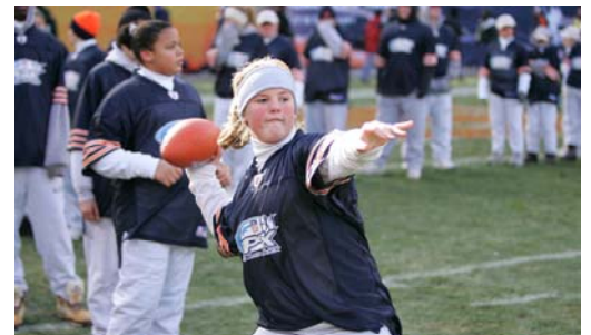
A Punt, Pass & Kick participant competes during pre-game of a Bears home game in 2004.

four separate age divisions (8-9, 10-11, 12-13, and 14-15) compete against each other in punting, passing and place kicking. The PP&K program is free - both to organizers who host a local competition and to every youngster who wants to participate. This competition is offered at Chicago schools, through the YMCA of Metropolitan Chicago, several Chicagoland park districts, and school physical education classes. For more information, please log on to www.NFLyouthfootball.com .