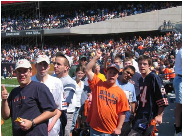
Some of "Urlacher's Backers" cheer on the Bears during a home game in 2004.