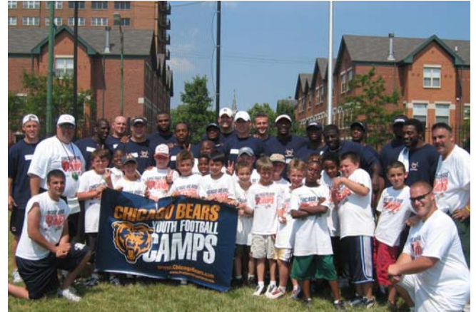
The Bears 2005 Rookie Class poses with campers and coaches at a Bears Youth Football Camp.

CHICAGO BEARS YOUTH FOOTBALL CAMPS: These week-long, non-contact day camps officially wrapped up on Friday, July 29 in Crystal Lake. In the first three years, over 2,100 kids have participated in the Chicago Bears Youth Football Camps, presented by Gatorade, in 17 different neighborhoods throughout Chicagoland. Highlights from this year's camps included several visits by Bears mascot Staley, a visit by the entire Bears 2005 Rookie Class at the Chicago location, and hundreds of happy campers across Chicagoland! For information about the camps in 2006, please call (312) 226-7776 or visit www.ProSportsExperience.com/bears .