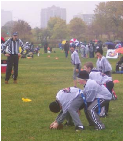
NFL Flag Regional Tournament 2004

NFL FLAG FOOTBALL: Whether you want to play NFL FLAG Football or start a league in your area, this is your chance. Log on to www.NFLyouthfootball.com to find out how to become part of the National Football League's premiere youth football program. NFL FLAG Football offers all the action and excitement of the game in your community. It is a non-contact football program for boys and girls ages 6-14 that promotes physical fitness and teaches youngsters valuable football lessons about teamwork and fair play.